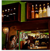
On Mauritius With a Non-Jet-Set Wallet