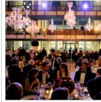
Trustees Find Board Seats Are Still Luxury Items

For e-books to thrive, the model for permission to use copyrighted material in new work has to be fixed.