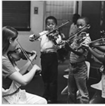
Harlem Arts School Shuts Over Financial Problems